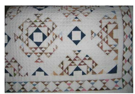
Crown of Thorns Quilt

Out of these needs as well as a scarcity of fabrics, a brilliant art form emerged – needle art. Generations of quilters in America passed their knowledge from one to the other like links in a chain, forming an unbroken record of history. Every scrap of fabric was precious to the pioneers who had no cloth available other than what they had brought from Europe or could make by hand, which was a long and difficult task. Pioneers also preserved the memories of those gone before by utilizing precious fragments of their clothing in their needle work. The whole fabric of life that went into the building of America was built into these quilts. The quilt in America is so much a part of its history.