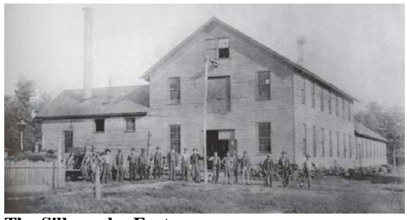
The Silberzahn Factory

The introduction of silos into Wisconsin's agricultural economy allowed dairy farmers to store livestock feed, or silage, safely and economically. Cutting feed mechanically for the silos led to the introduction of the Silberzahn Ensilage Cutter with its patented reversible gear. Silberzahn also began production of feed elevators for filling silos and upper stories of barns.