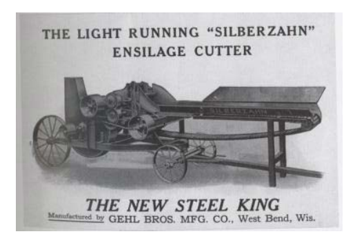
The Silberzahn Ensilage Cutter