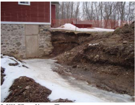
Mill Handicap Entry

As you can see, winter is starting to let go of its cold snowy grasp of the Mill's Phase 2 Retaining Wall Project. I am in the process of lining up additional contractors to bid the job for us. If any member out there knows any masonry contractor that might be interested in bidding the job at a really good price for RHS, please contact me with their information. Other than finalizing plans for the retaining wall and ramp, there isn't much else going on at the Mill until winter lets go!